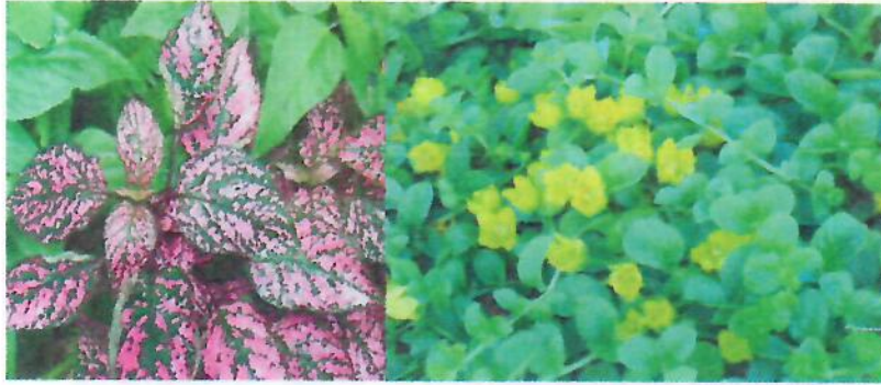
Juniper and Gold Cypress